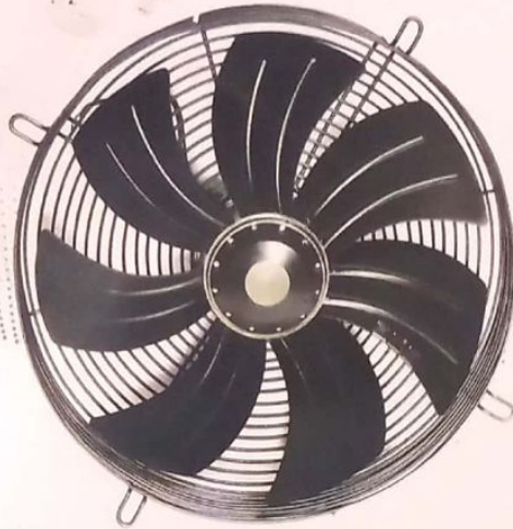
Axial IEC Series Fan, Reverse, Frameless