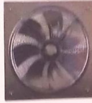
Axial IEC Series Fan, with frame